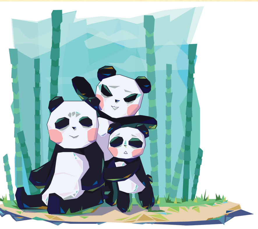
Clip Art by Crystal Li BOSS Grade 12